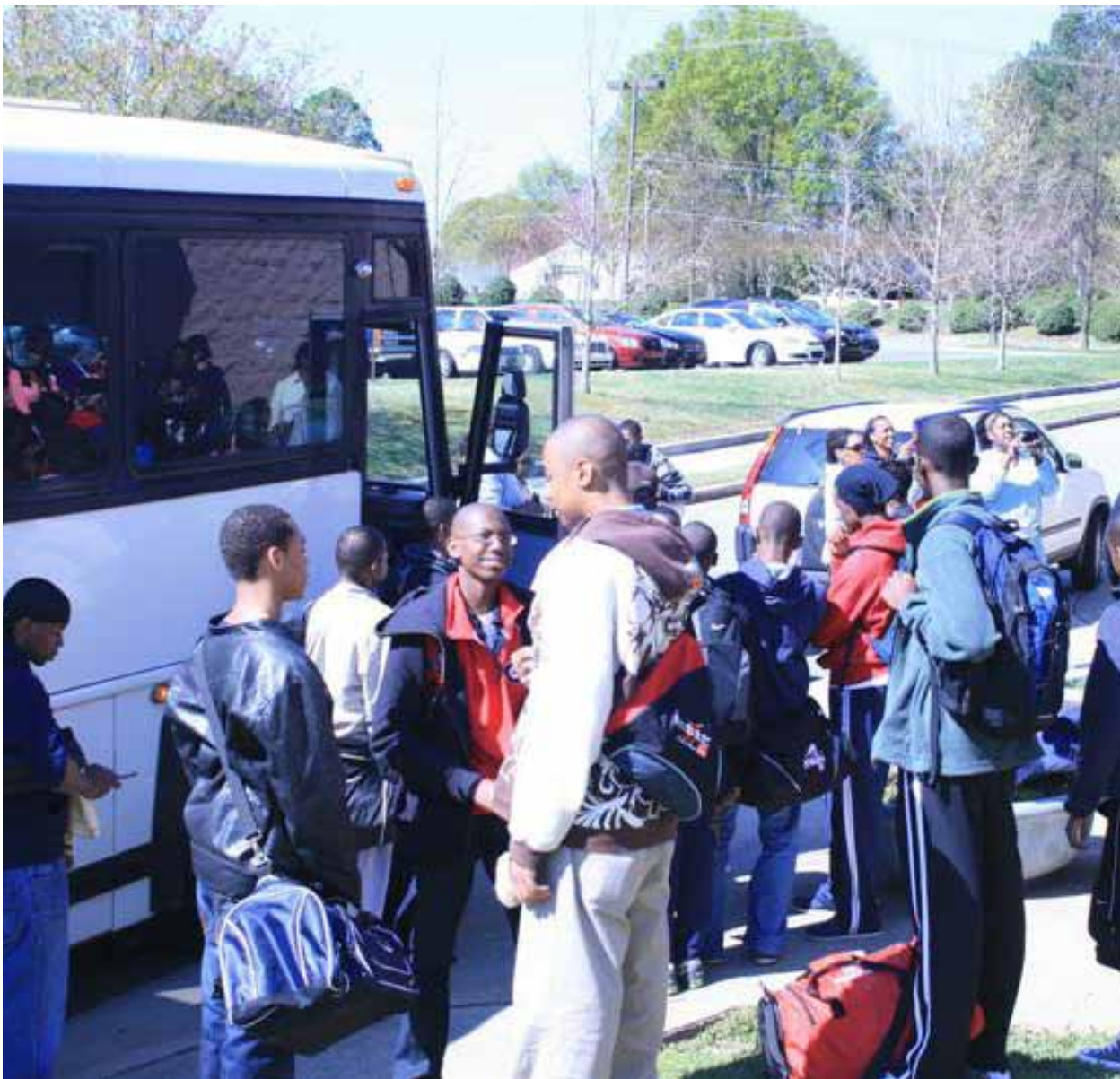
Boarding Buses for the College Tour