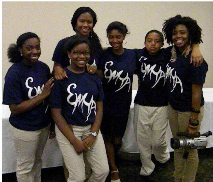
Education Ministry Youth Ambassadors (EMYAs)