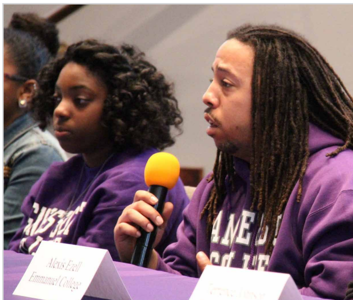
College Discussion Panel