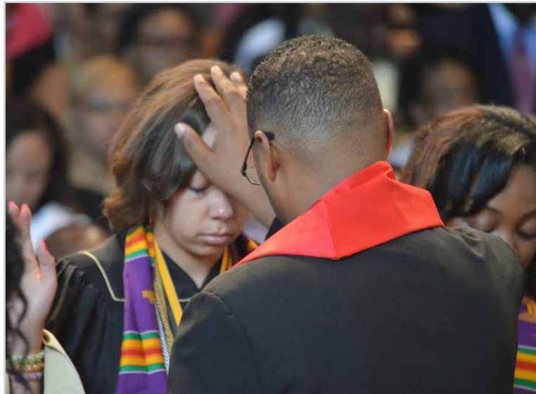
Blessing Youth as They Begin the Next Phase