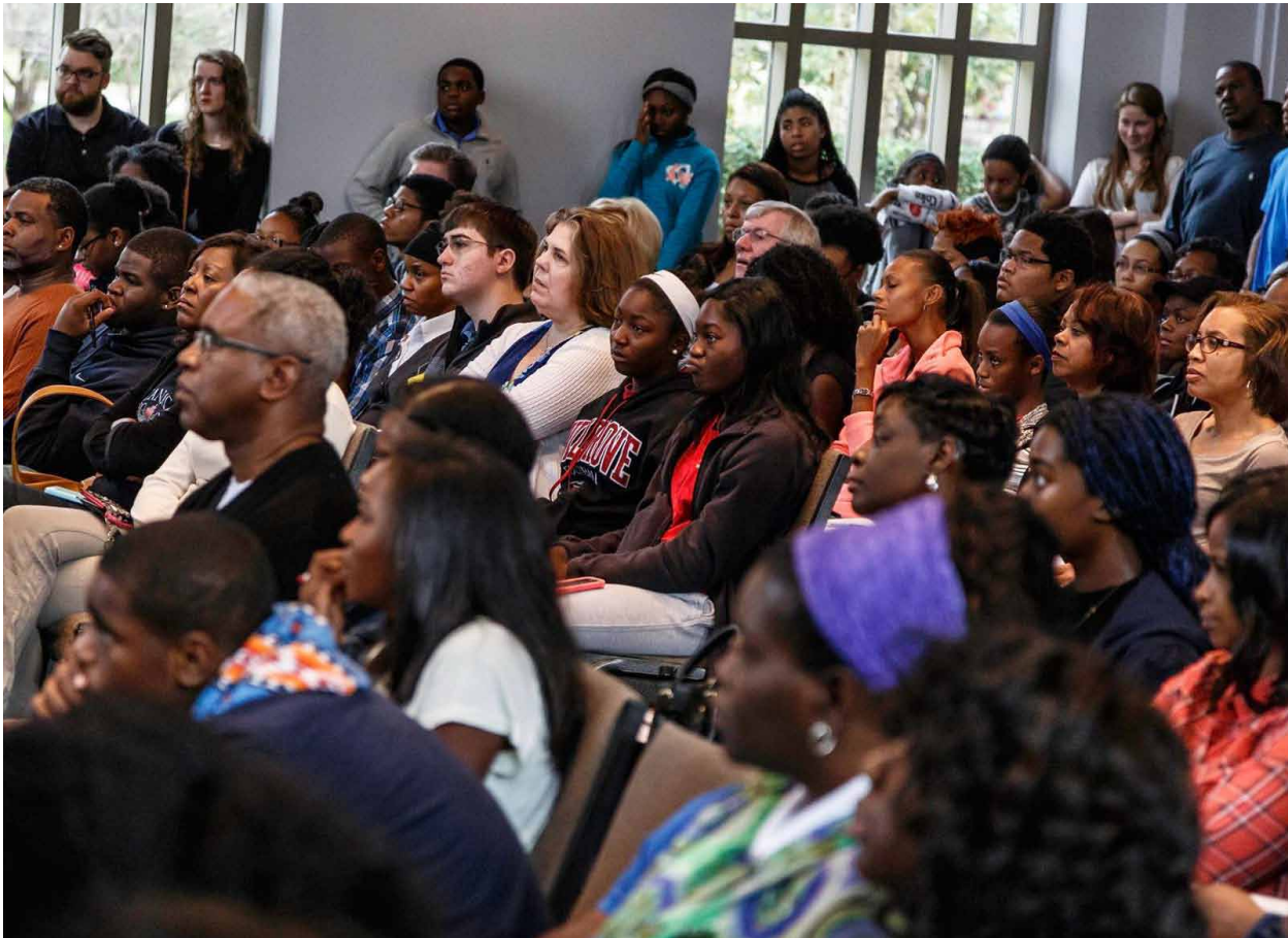
Pre-College Fair College Planning Workshop