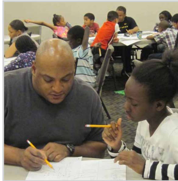
Reading and Math Tutoring