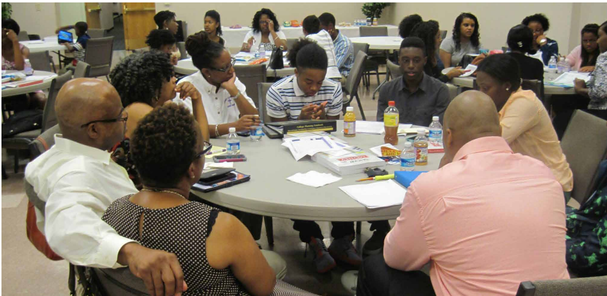
College Planning Cohort, Modeled After 'Small Groups'