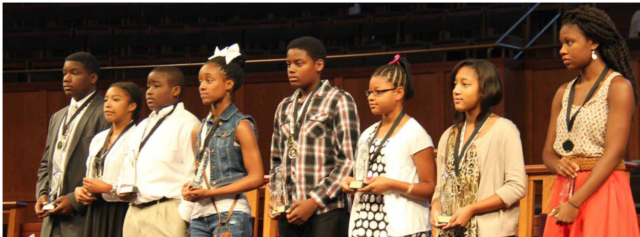
Marcus Awardees, Highest GPA in 6th - 11th Grades