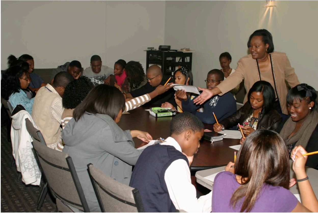
“The Next Episode,” Bible Study and College Planning for High School Juniors and Seniors