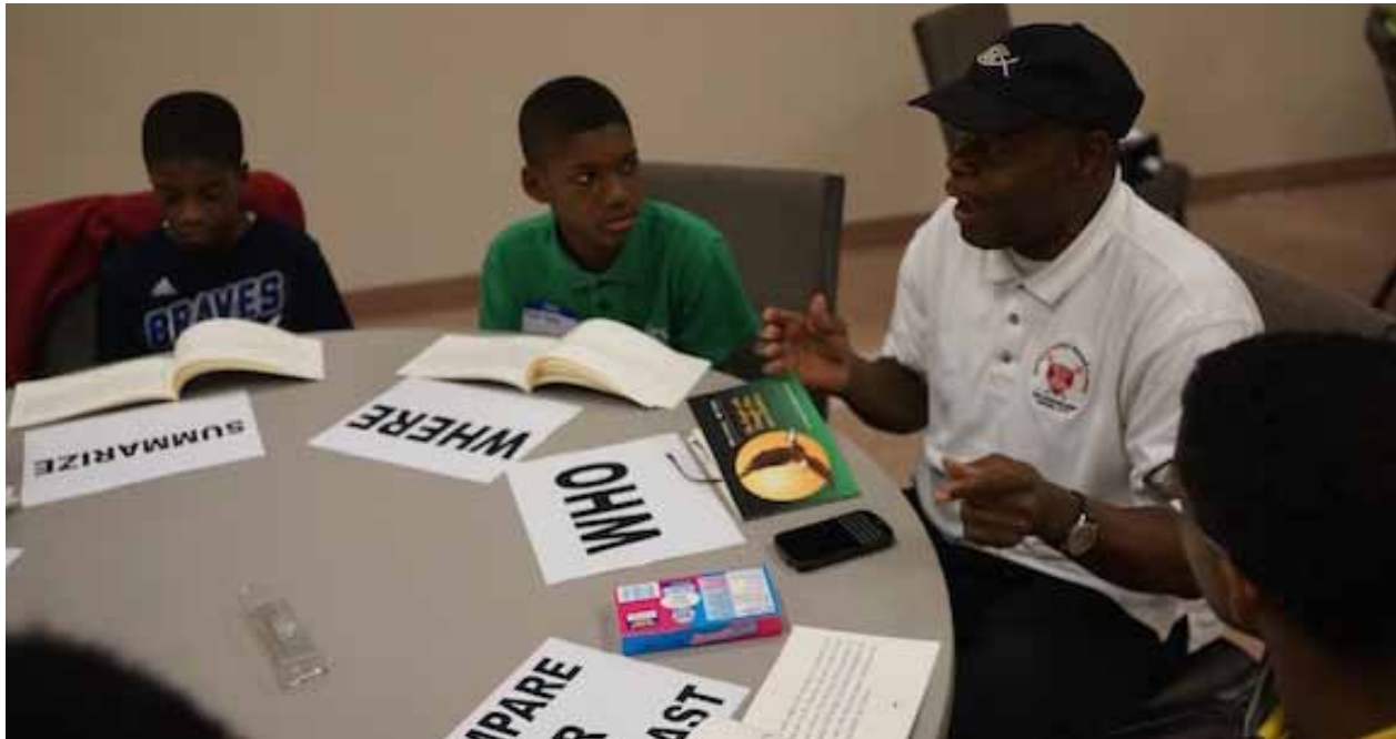
Iron Sharpens Iron Male Mentoring Book Club